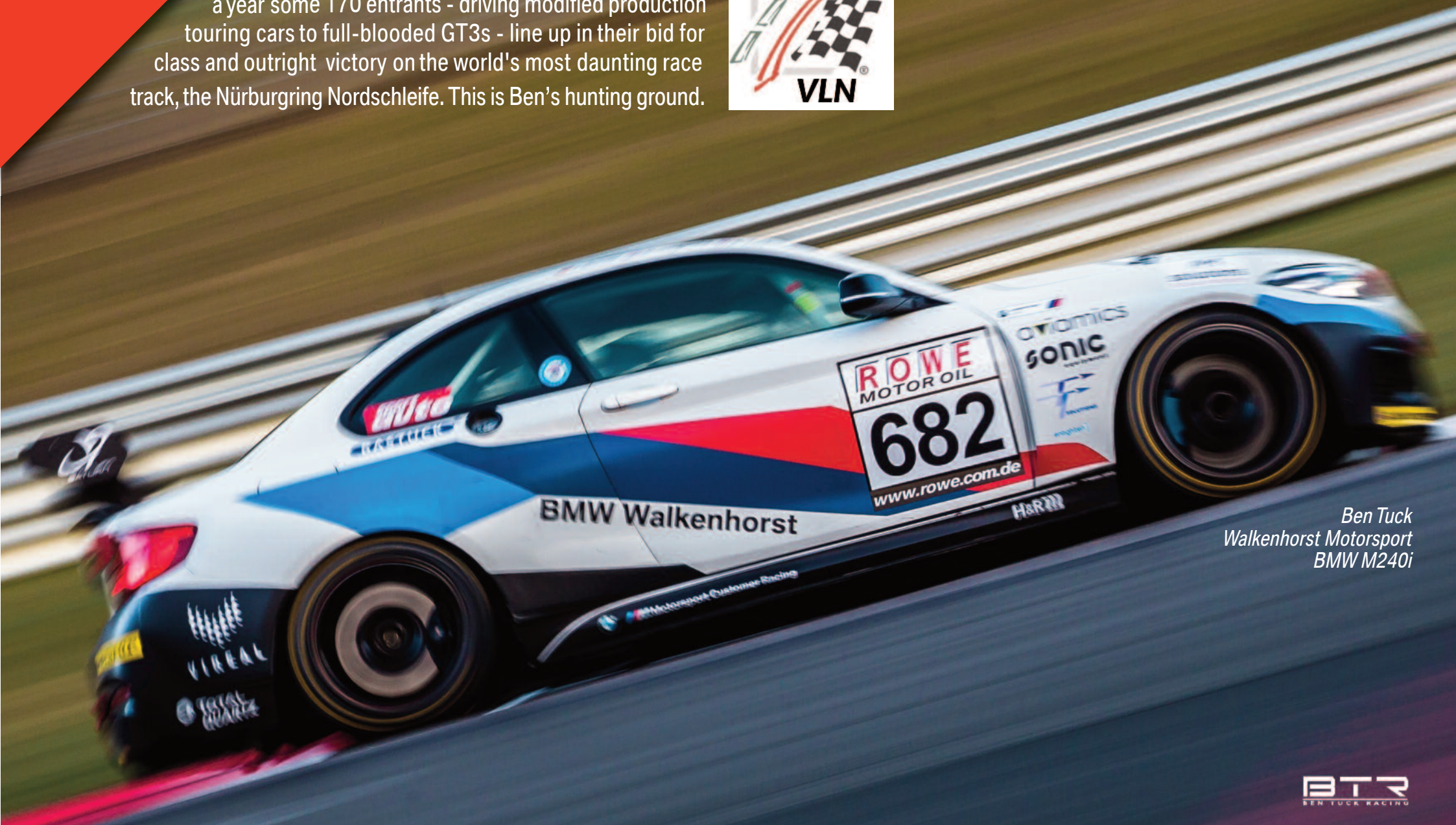
Ben Tuck Walkenhorst Motorsport BMW M240i